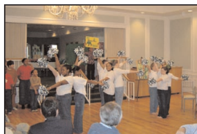
Oak Hill Middle School, Scenes from Hercules